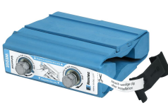
Wedge & Wedgekit